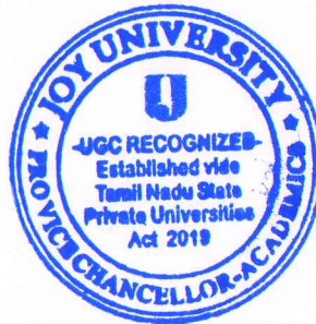
Pro Vice Chancellor Joy University

All Concerned shall make a note of the above for compliance.