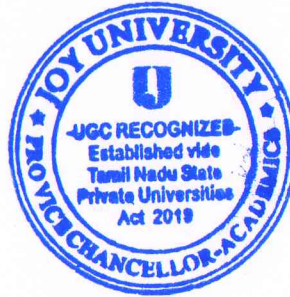
Pro Vice Chancellor Joy University

All Concerned shall make a note of the above for compliance.